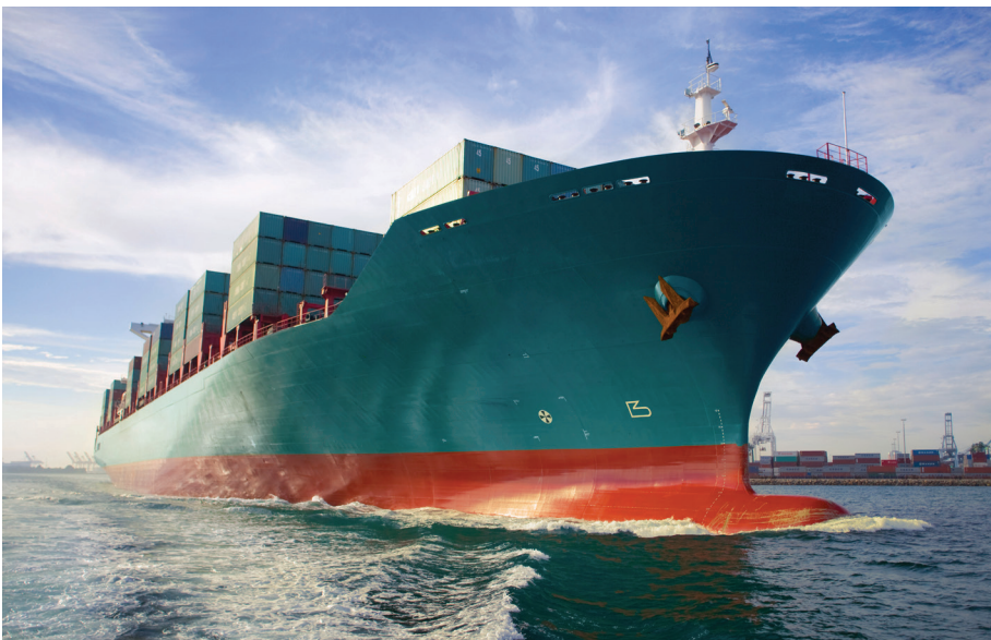
Prompt shipboard maintenance and repair services in every major seaport in the world