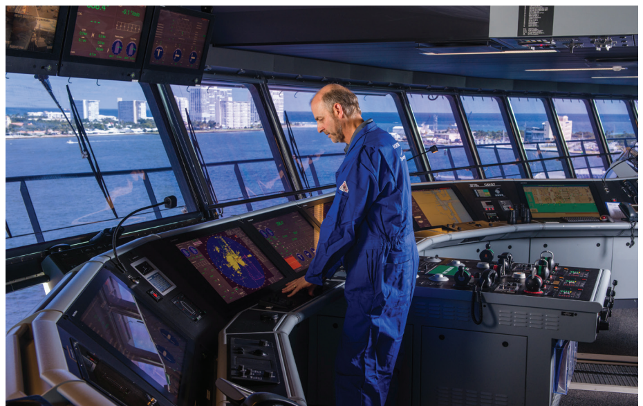
Worldwide service with skilled and trained Marine Service Engineers

We can offer proven retrofit solutions for all Sperry Marine products, as well as those of virtually any other manufacturer. With many years of retrofit experience, and our expertise as a manufacturer, we have the essential skills and equipment to integrate technologies of different generations and systems.